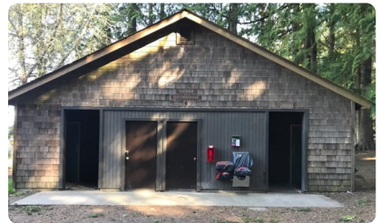
Main Camp Bathrooms & Showerhouses