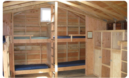
Typical Main Camp Cabin Interior

Main Camp cabins are more rustic, located on the beach or nestled among the trees. Fully enclosed, these house up to 10 participants in bunk beds, participants provide their own linens. Some cabins have electricity; bathroom facilities with showers are a short walk away. If you require electricity for medical reasons, please inquire during registration.